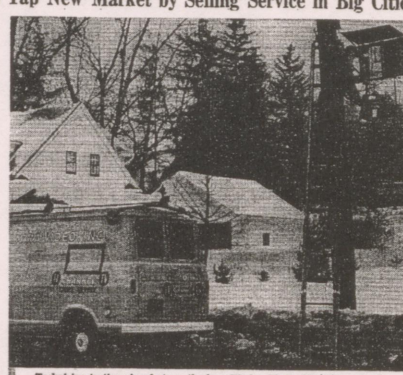
ting signal strength along Elmira, N. Y., TV cable network